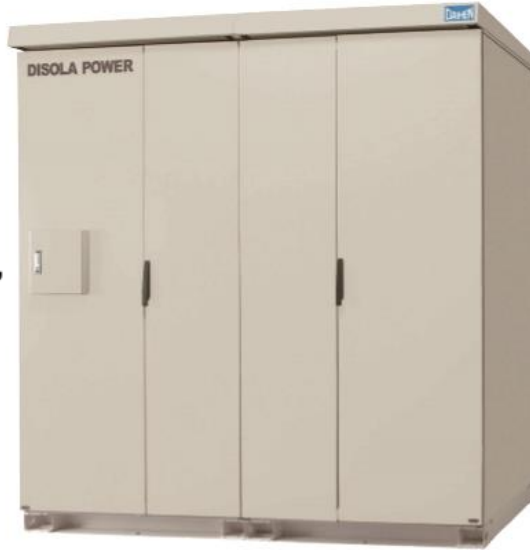
DISOLA POWER 500HV-HEX

Outdoor “Air-conditioner Free” SOLAR INVERTER